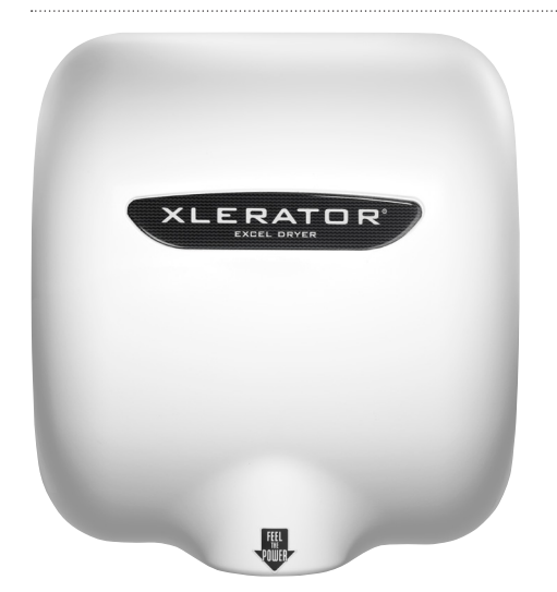
XL-BW White Thermoset Resin (BMC)